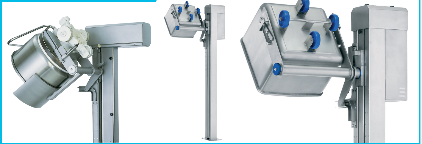
Lifting and tipping device type 27000