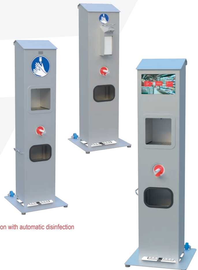
Version with automatic disinfection