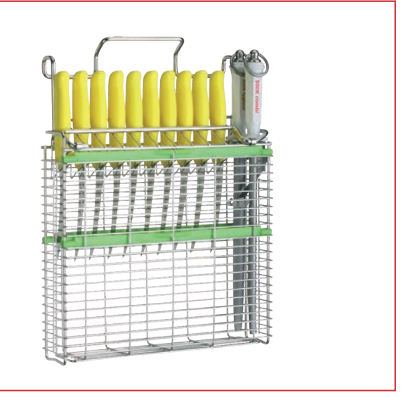
Fixation for five knife holders type 22240

DK: kolding@frontmatec.com Phone: +45 763 427 00