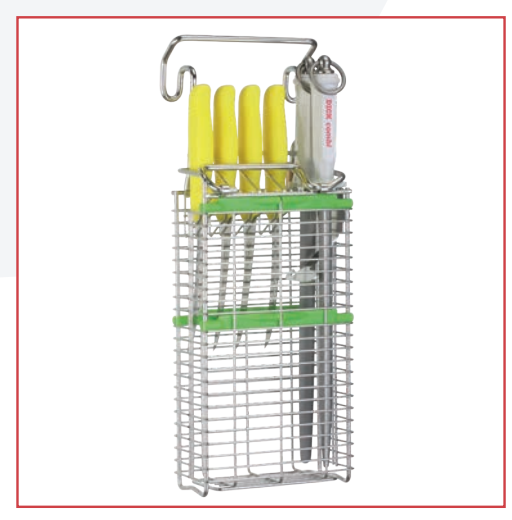
ITEC knife holder type 22240