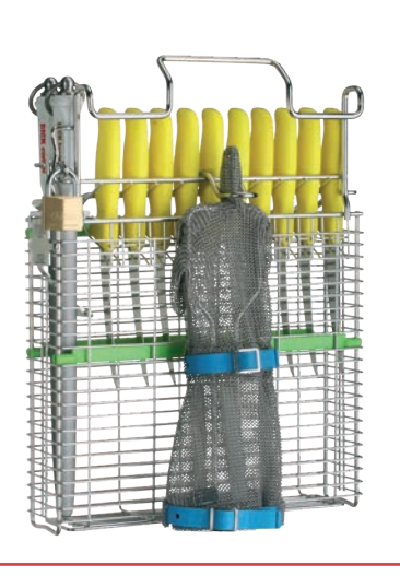
ITEC knife holder type 22240/22200