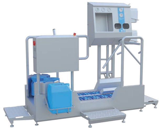
Walk-through boot cleaning machine type 23830-1000 with Inlet Complete