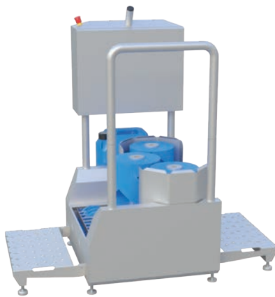
Walk-through boot cleaning machine type 23830