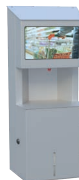
Manotizer with display, alternative hand disinfection