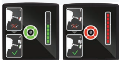
SXcan, included in Clean Guard version