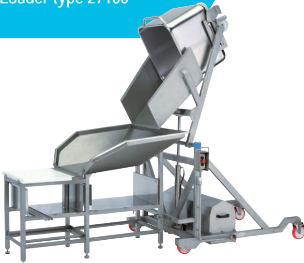
Swing-Loader type 27100 with table