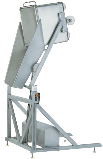
Swing-Loader type 27100