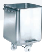
Trolley - 300 l