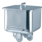
Trolley - 200 l - with lid