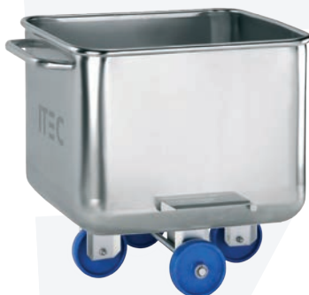
Trolley type 2410 - 200 l