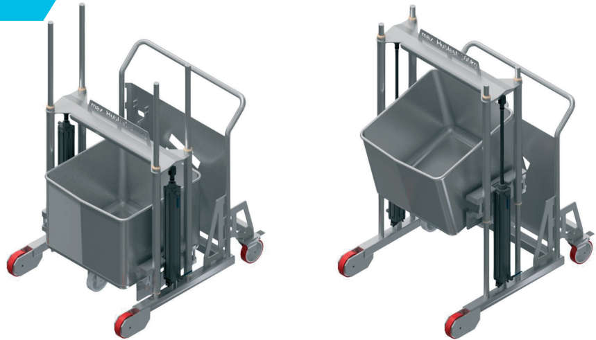
Pneumatic lifting device type 2740